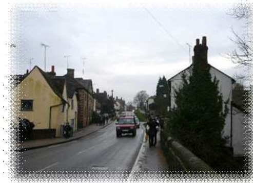
Newport, Essex, England (facing south)