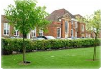
Newport Free Grammar School