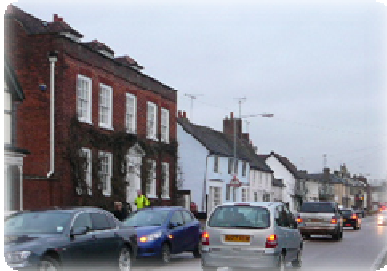
Newport House, Newport Essex

Interestingly, John Howland, owner of Stonehall in 1567 is listed in manor records as “at the stone” 13 . Seemingly that could have referred to either “Stonehall” house or its location near one of the Sarsen stones. Nonetheless, there are several documented indications that Stonehall was to the west of the high street at the southern end of town and therefore indicating the property near the pond. The mention of Stonehall in tax records as “near to Newport House”, the Georgian styled house still standing west of high street in the southern end of the village, suggests a more confirming location of Stonehall. Further confirmation of the property/building location is given in a 1760 rental agreement of the manor, as being “on the west side of South Street” 14 , “near Newport House”. These details provide a probable property location; however, whether the structure was made of stone is still in question. Currently, there are a number of modern two-story structures on the land thought to be that of the former Stonehall Manor. The manor property had about 200 feet frontage on the high street and extended east and west an unknown number of acres.