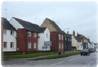
Possible location "Stonehall"