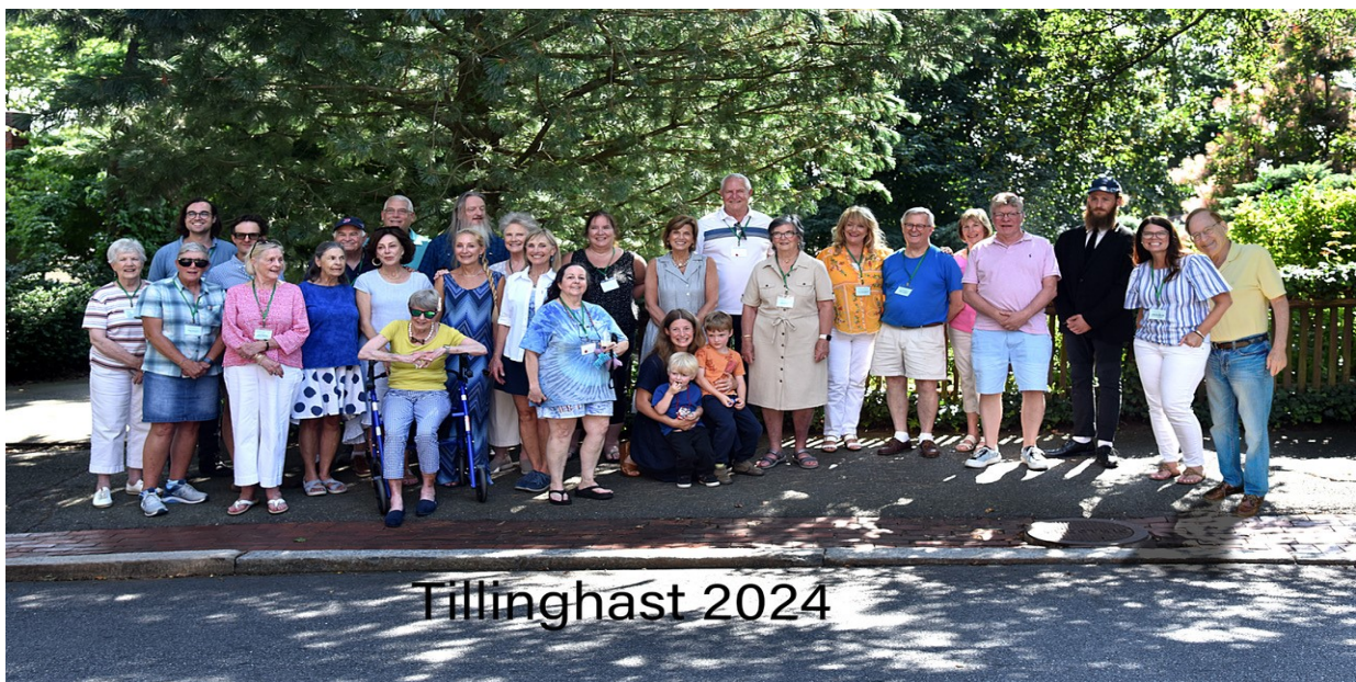
Just Tillinghast descendants